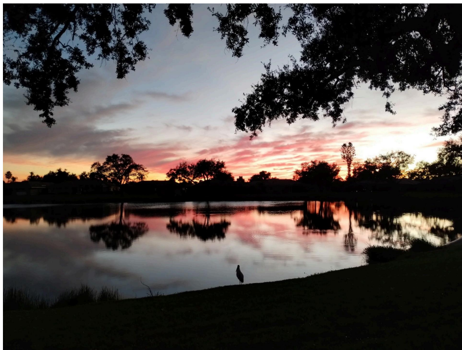
View from The Waverly

Some new information... A few friendly reminders